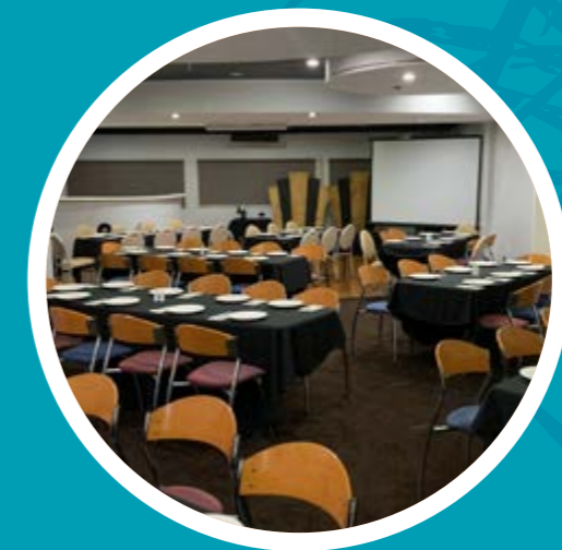
The Conference Room